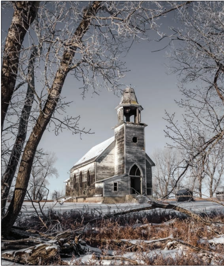
North Dakota