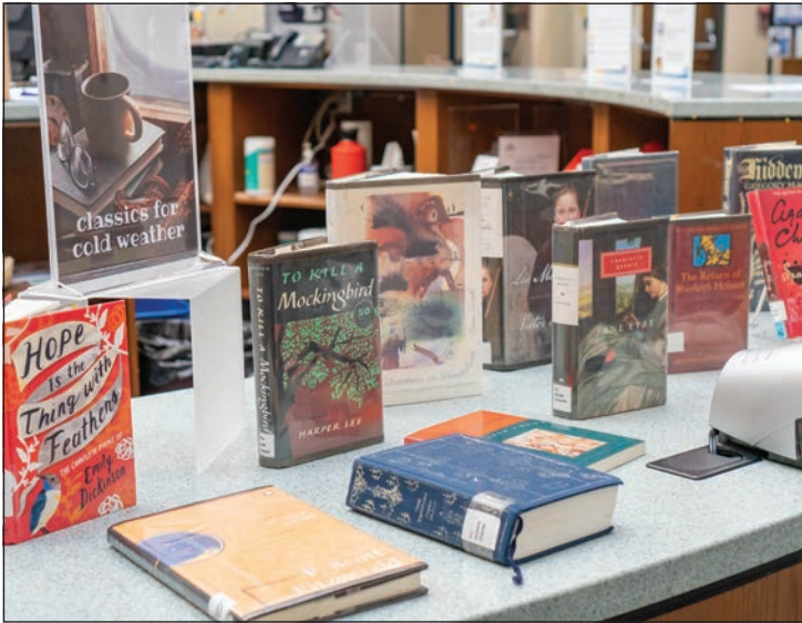
The main library has a "cold weather" book display