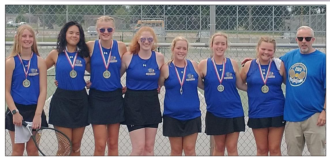
THE LADY WARRIORS TENNIS TEAM was crowned as the Madison Invitational Tennis Tournament Champion. Each girl contributed to the team win. The team had Bracket Championships at 2nd Singles, 3rd Singles and 2nd Doubles. The team had runners-up at 1st Doubles and third place for 1st Singles. The group effort earned enough team points to win the team championship.