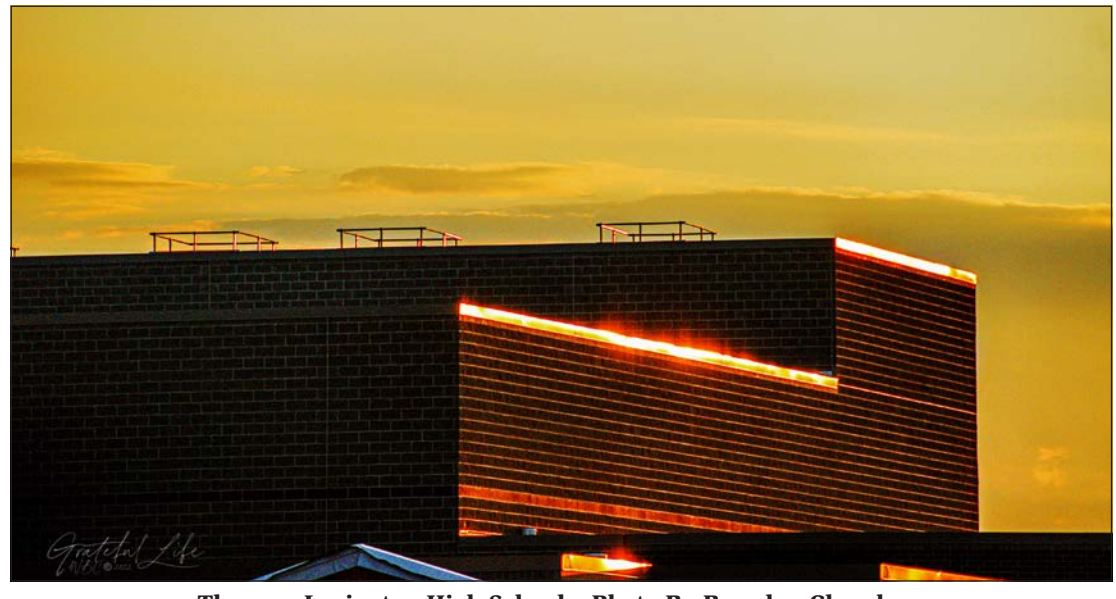
The new Lexington High School