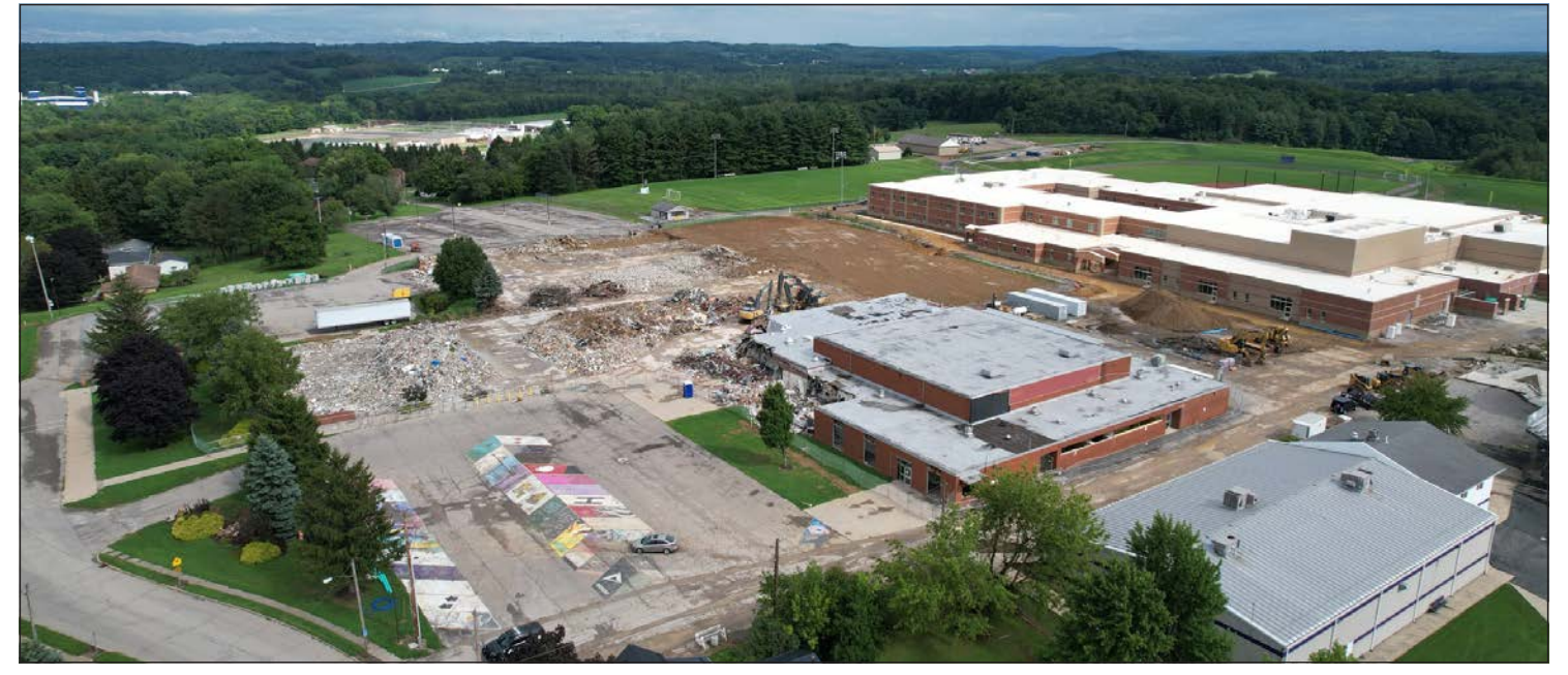
AN AERIAL VIEW shows the new Lexington High School and the continuing demolition of the previous building. The new school opened its doors Tuesday, Sept. 6, for the 2022-'23 school year.