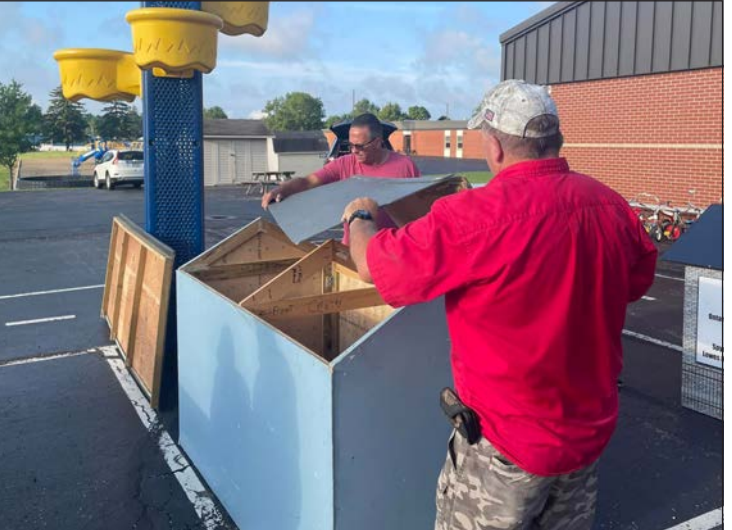
THE 2022 SAFETY TOWN has begun at Stingel Elementary in Ontario. The Ontario Lions Club sponsors the event and worked to set-up the driving course.