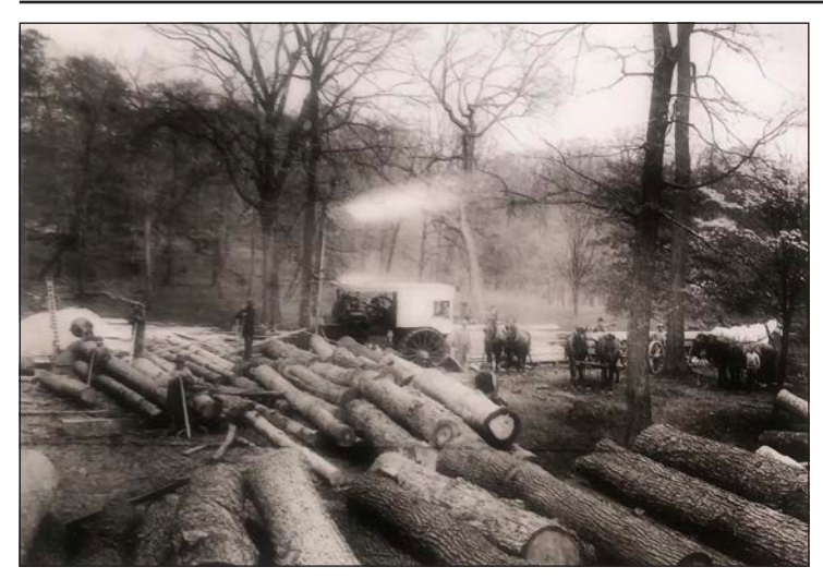
THE SAW MILL came to the trees in this 1880 era picture. Note the lumber behind the steam engine.