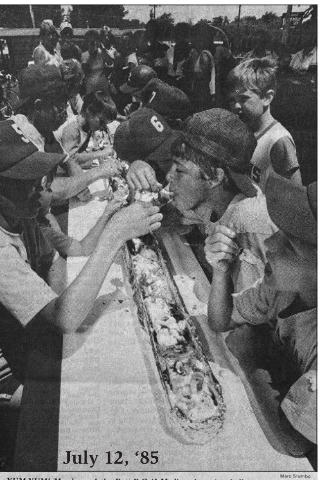
YUM-YUM! Members of the Putt-R-Golf Madison boys baseball team put away a 10-foot banana split Saturday. The boys earned the treat as one of several Madison teams voted most popular in their respective divisions. The dairy feast was provided by Jim's Sweet Shop on Ashland Rd. and was made in a foil-covered piece of spouting.

Receive the Tribune-Courier Issue Each Week by Joining the FREE Weekly email list Send an email with name to news@tribune-courier.com