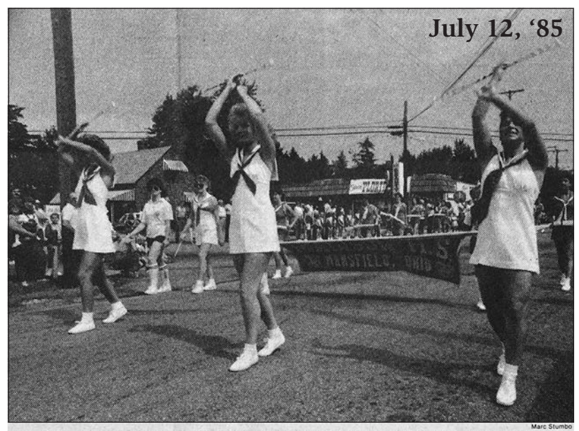
MARCH DOWN RT. 42 — The Madison Comprehensive High School marching band turns the corner at Indiana Ave. last Thursday morning as the Madison Cares 4th of July parade made its way from Stewart Rd. to Lincoln Heights School on Grace St. Blue skies prevailed as a large number of Madison area residents lined the parade route to witness the annual Independence Day event. A complete photo wrap-up of the event is inside this issue.