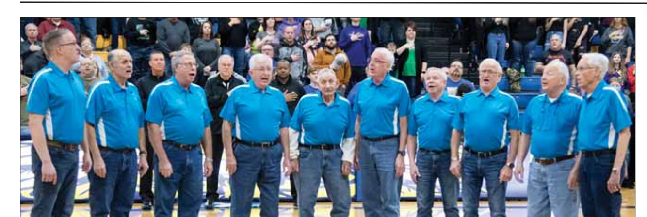
FUN CENTER CHORDSMEN members sing The National Anthem before the start of the Ontario vs. Clear Fork boys varsity basketball game played in the O'rena on Jan. 25.